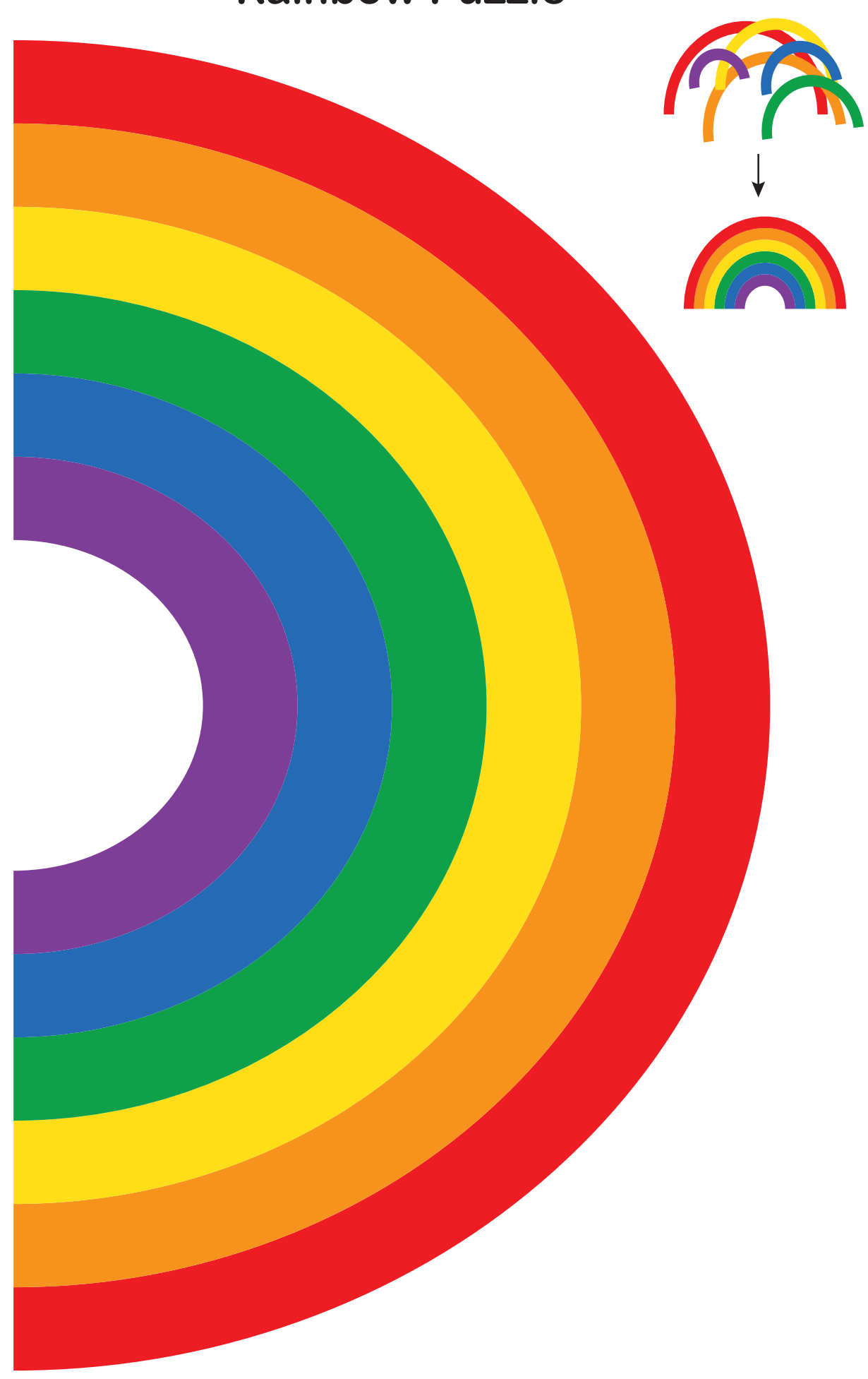
Copyright © by KIZCLUB.COM. All rights reserved.